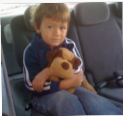
Off to the Community Center

Later, mom said it was time to take a bath. My sister and I were in the bubble bath when all of the sudden Dash jumped in too! We laughed and laughed, he's good at the doggie paddle! After my bath, Dash cuddled with me and we fell fast asleep, he said he really loved my MU blanket!